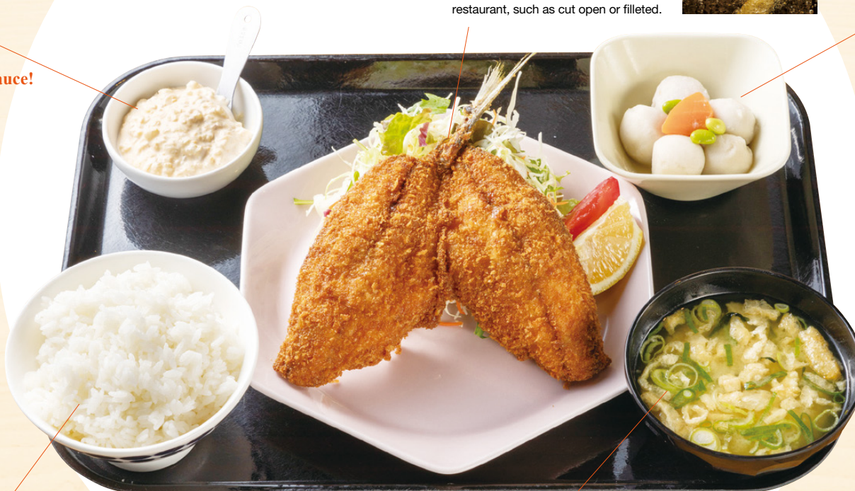
Note: Photos shown are for illustrative purposes only.

Compared to tonkatsu (pork cutlet) and hamburger steak, where the taste explodes with the first bite, aji fry brings a feeling of happiness as its flavors slowly unfold in your mouth. Your heart will flutter when you hear that aji fry is on the menu tonight. That's the true potential of aji fry.