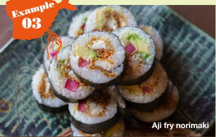
Aji fry norimaki