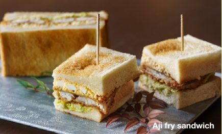
Aji fry sandwich