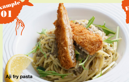
Aji fry pasta